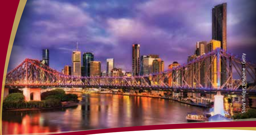
Story Bridge, Brisbane

The 2022-23 Queensland Budget supports good jobs , provides better services for all Queenslanders and protects our great lifestyle . In Brisbane and Redlands it provides: