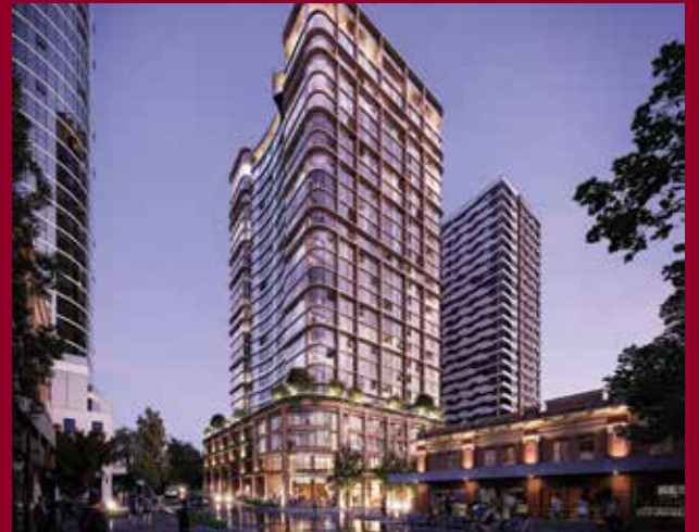
Artist impression of apartment building by Frasers Property Australia

Brisbane's northside will receive a boost in social and affordable housing in Chermide and Redcliffe with the development of 118 apartments through the government's $1 billion Housing Investment Fund. The projects will support a combined 128 construction jobs in South East Queensland.