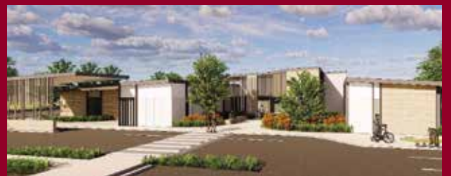
Artist impression of the new Redlands health facility