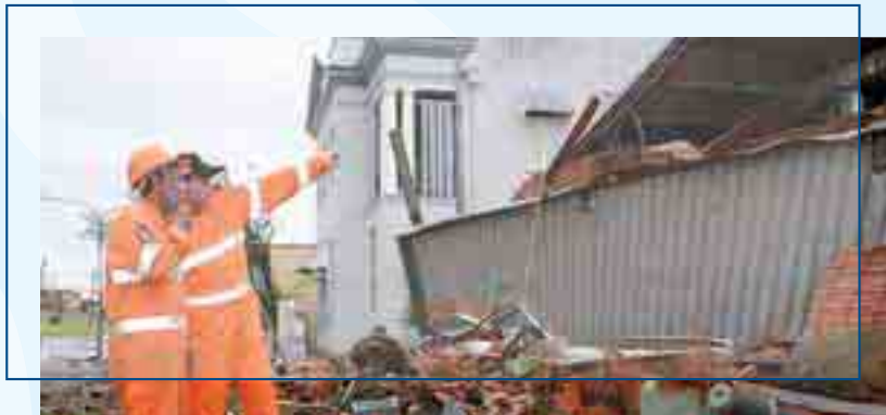
Cyclone Larry response