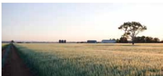
Young wheat growing on the Darling Downs near Jondaryan