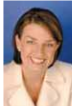
Anna Bligh MP Premier and Minister for the Arts

The Queensland Government is investing $18 billion in its jobs-generating building program, with