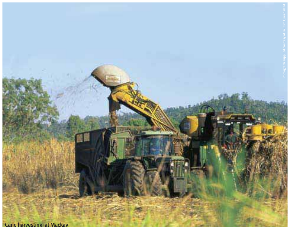
Cane harvesting at Mackay