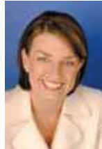
Anna Bligh MP Premier and Minister for the Arts

Queensland's prosperity and growth is built on the strength of our regions. This document puts on record the Government's commitment to the people and economy of the North Coast region.