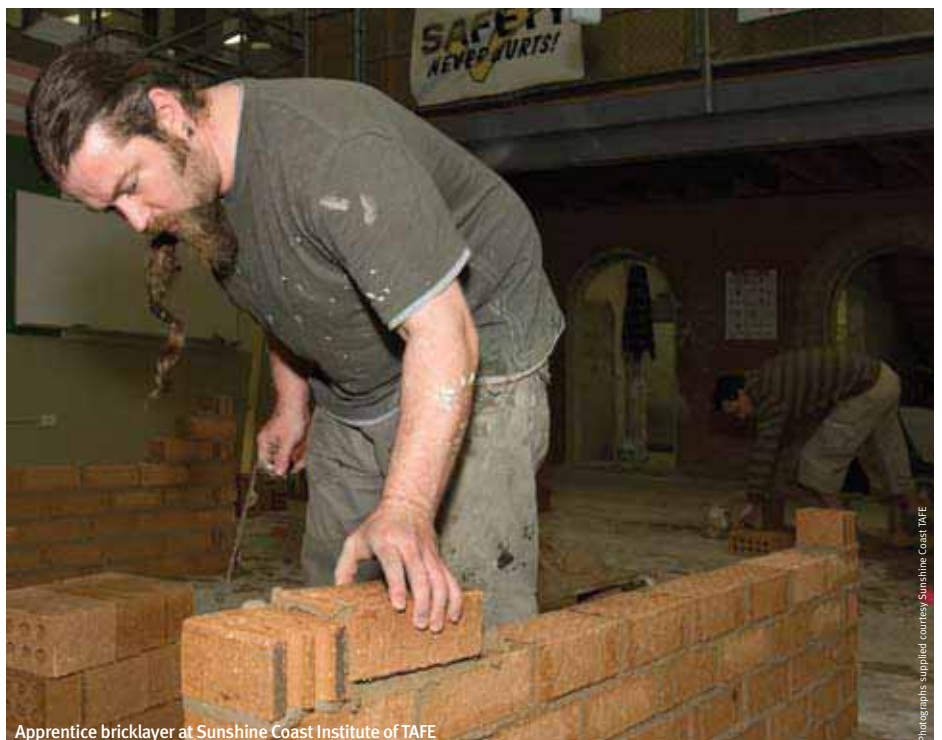
Apprentice bricklayer at Sunshine Coast Institute of TAFE