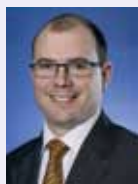
Andrew Fraser MP Treasurer and Minister for State Development and Trade

The 2011-12 State Budget will strengthen Queensland's economy and deliver on our commitment to protect Queensland jobs.